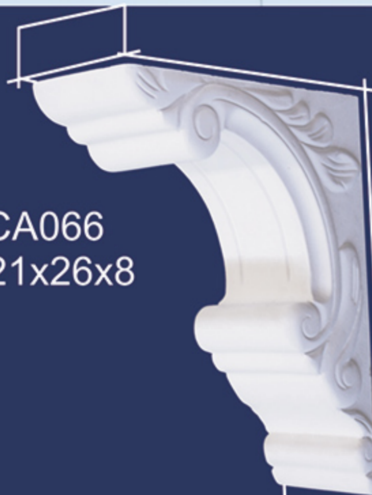
Art. CA066 cm. 21x26x8