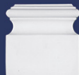
Art. BS027 cm. 13x12,5x3,5