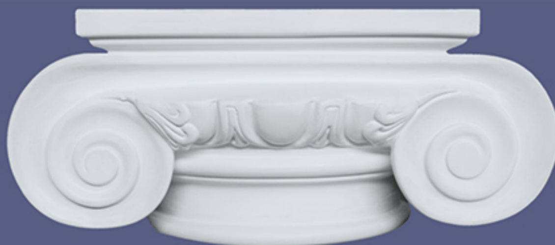
CA029 cm. 41x24 H.18

Capitello per colonna in gesso diametro cm. 22 predisposto per montaggio in "kit"