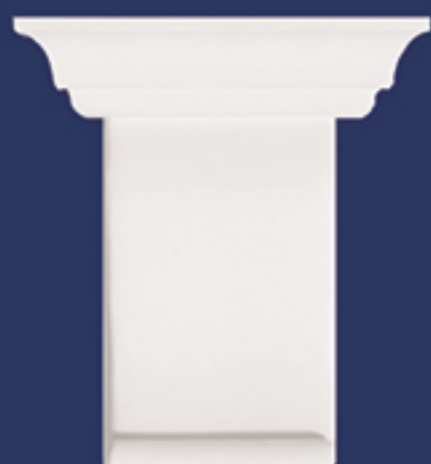
Art. CA067 cm. 20x12,5x6,5